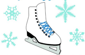
Figure Skating Club